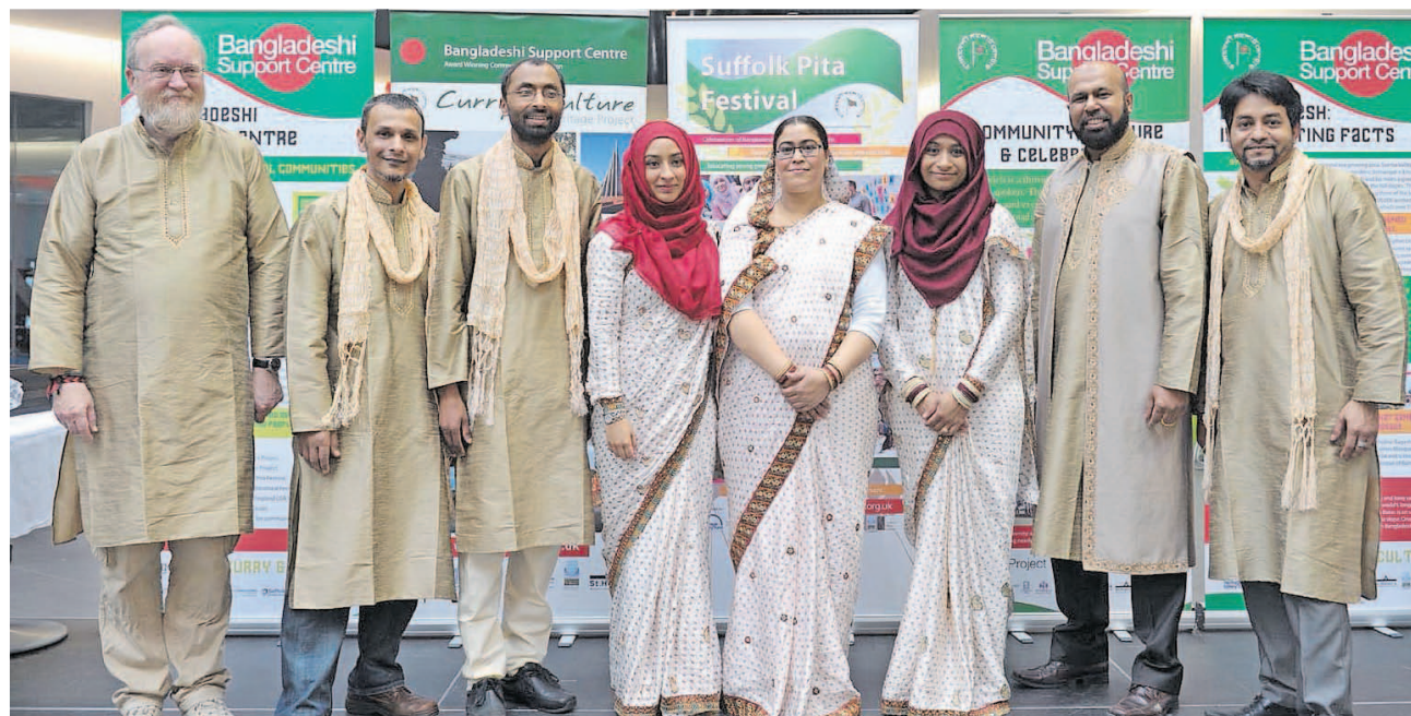
■ People were invited to join an exhibition of traditional Bangladeshi sweet and savoury foods on Sunday at Suffolk New College. Above, the BSC team. Inset images below, brightly coloured and intricately designed dishes.